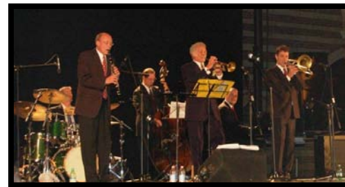
Verona Jazz Festival Italy June, 2007